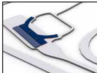
Drift School Area