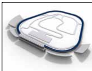
Oval Circuit 1.5 miles