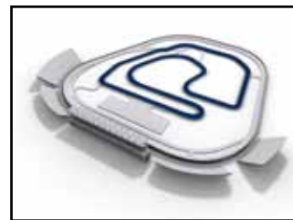
National Circuit 1.7 miles